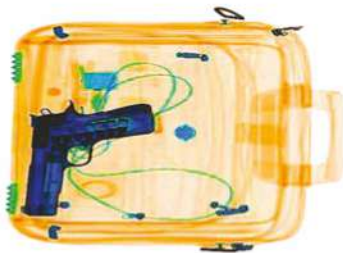
Excellent image quality. Organic materials shown in orange, metal in blue and a mix of them in green.